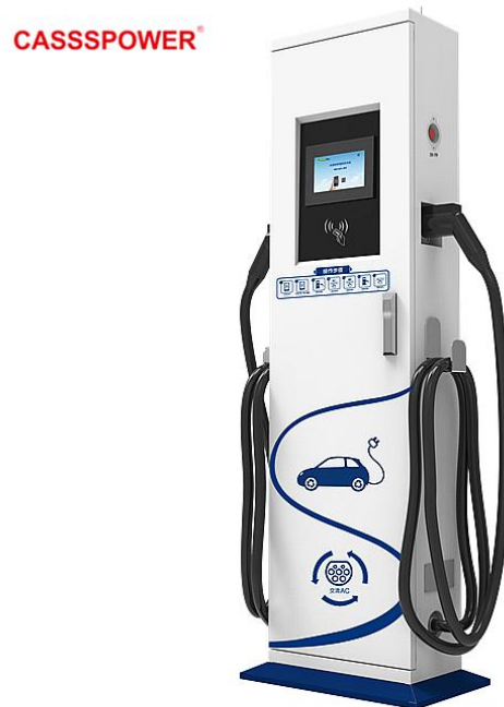
7kw/14kw Floor-type advertising AC charging point